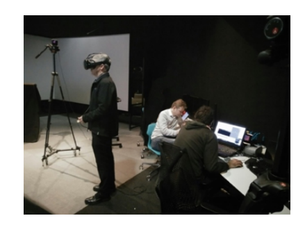
Figure 2. Participant using the HMD simulator to detect an object of interest in maritime SAR imagery.

computational power and bandwidth for real-time stitching and processing of uncompressed video streams for this simulator environment.